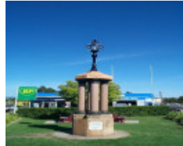
1 commonwealth memorial stawell