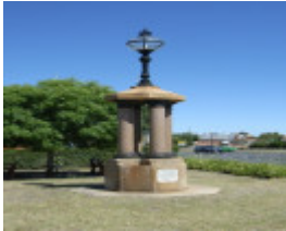
COMMONWEALTH MEMORIAL, STAWELL SOHE 2008