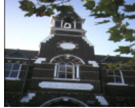
primary school number 1467 malvern road hawthorn detail of bell tower