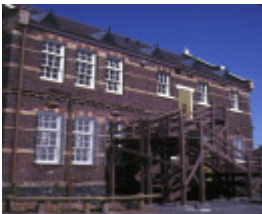
primary school number 1467 malvern road hawthorn side view entrance