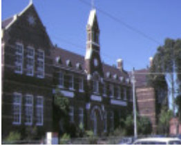
1 primary school number 1467 malvern road hawthorn front view nov1984