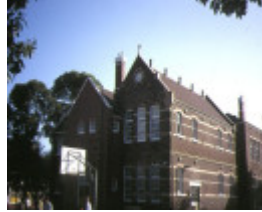
primary school number 1467 malvern road hawthorn rear view 1994