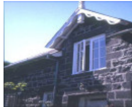
h00457 the Hawthorns Creswick St Hawthorn upper front window