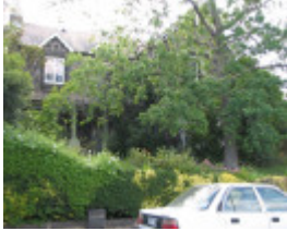
THE HAWTHORNS SOHE 2008