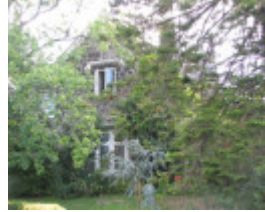
THE HAWTHORNS SOHE 2008