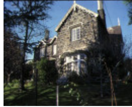
1 the Hawthorns Hawthorn front view jun1978