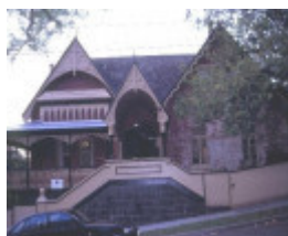
h00552 1 alloarmo grattan st hawthorn external front view she project 2003