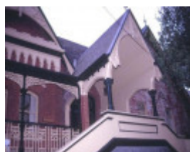
alloarmo grattan st hawthorn front gables she project 2003