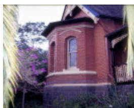
alloarmo grattan st hawthorn bay window she project 2003