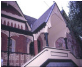
alloarmo grattan st hawthorn front gables she project 2003