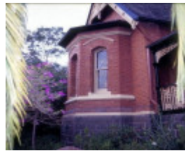
alloarmo grattan st hawthorn bay window she project 2003