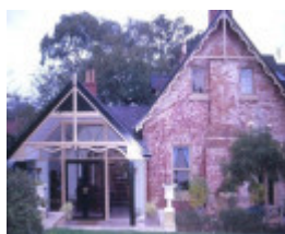
alloarmo grattan st hawthorn rear view she project 2003