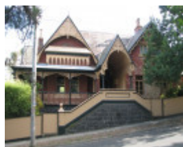
ALLOARMO SOHE 2008