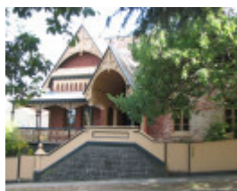
ALLOARMO SOHE 2008