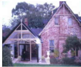
alloarmo grattan st hawthorn rear view she project 2003