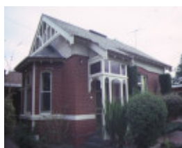
immigration reception centre hawthorn side view