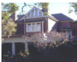
h00788 shenton kinkora rd hawthorn rear view