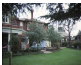
immigration reception centre hawthorn rear garden jun1984