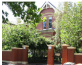
SHENTON SOHE 2008