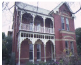
1 immigration reception centre hawthorn front view jun1984