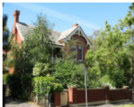
SHENTON SOHE 2008