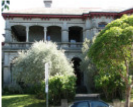
KAWARAU SOHE 2008