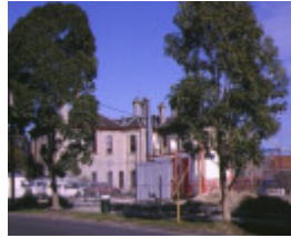
1 kawarau hawthorn rear view