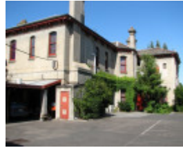
KAWARAU SOHE 2008