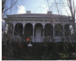
zetland yarra street hawthorn front view sep1978