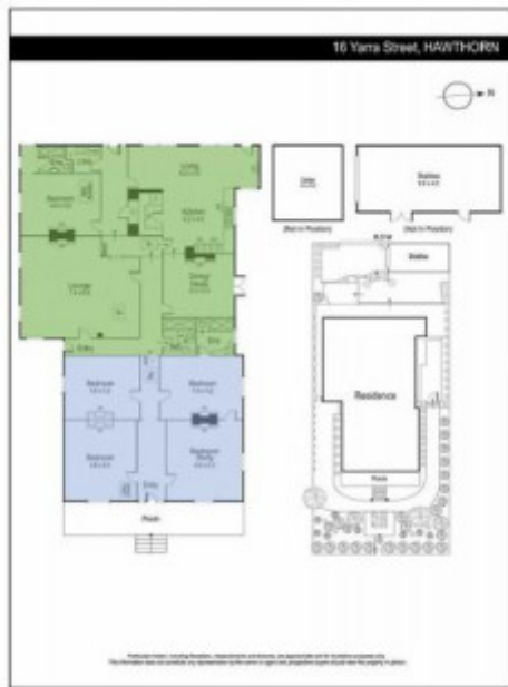
Figure 1. Floor plan of the Place with coloured shading to delineate the two permit exemptions relevant to the interior of the residence. Green indicates a permit exemption for all structural and non-structural internal works, blue indicates a permit exemption for all non-structural internal works.