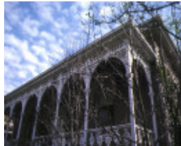
1 zetland yarra street hawthorn detail lacework sep1978