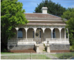
ZETLAND SOHE 2008