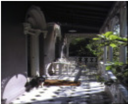
zetland yarra street hawthorn front verandah mar1987