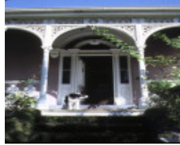
zetland yarra street hawthorn detail front entrance mar1987