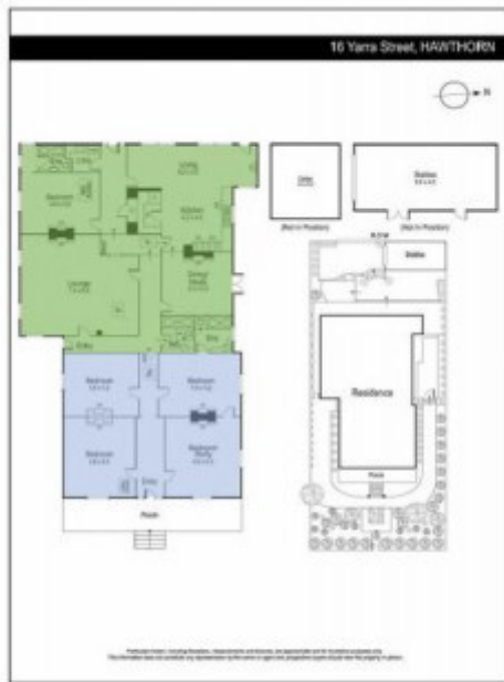
Figure 1. Floor plan of the Place with coloured shading to delineate the two permit exemptions relevant to the interior of the residence. Green indicates a permit exemption for all structural and non-structural internal works, blue indicates a permit exemption for all non-structural internal works.