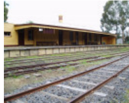
healesville railway station