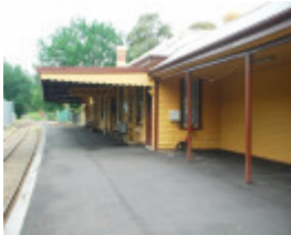
HEALESVILLE RAILWAY STATION COMPLEX SOHE 2008