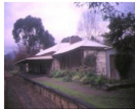
1 healesville railway station compelx healesville kinglake road healesville station building jun1995