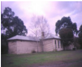
healesville railway station complex heasleville kinglake road healesville front view jun1995