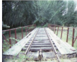
healesville railway station compelx healesville kinglake road healesville tracks feb1985