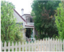
INNISFAIL SOHE 2008