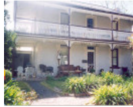
h00388 1 innisfail high street heathcote view from driveway she project 2003