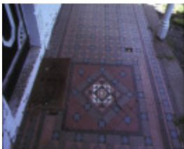
innisfail heathcote detail of- tiled verandah aug1979