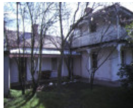
innisfail heathcote rear view aug1979