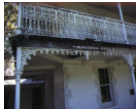
innisfail heathcote detail lacework oct1980