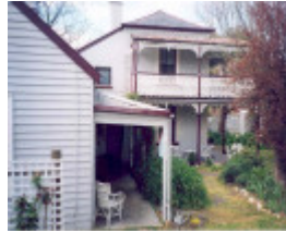
h00388 innisfail high street heathcote view from high street she project 2003