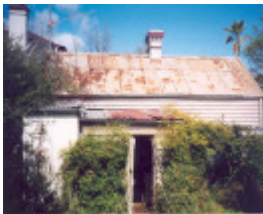
h00388 innisfail high street heathcote original maids quarters she project 2003