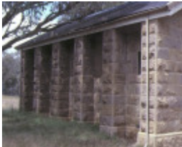
heathcote powder magazine rear view