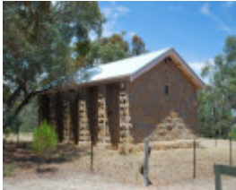
HEATHCOTE POWDER MAGAZINE SOHE 2008