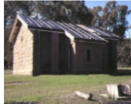
1 heathcote powder magazine side view aug1997