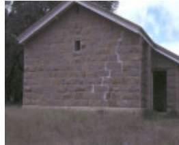
heathcote powder magazine end view nov1984