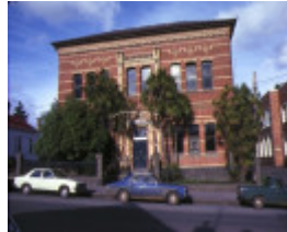
1 former ballarat east free library front elevation jul1982