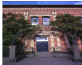
former ballarat east free library entrance detail jul1982