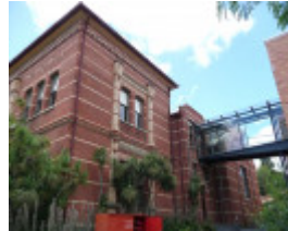
FORMER BALLARAT EAST FREE LIBRARY SOHE 2008