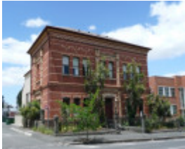
FORMER BALLARAT EAST FREE LIBRARY SOHE 2008