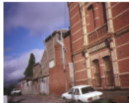
former ballarat east free library side elevation jun1989