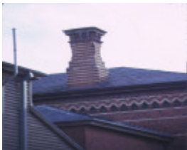
former ballarat east free library chimney detail jul1982