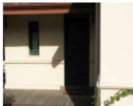
FORMER HEAD TEACHER'S RESIDENCE SOHE 2008