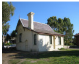
h01617 former head teacher's residence heidelberg side view 02 jan2001