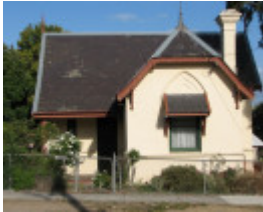
FORMER HEAD TEACHER'S RESIDENCE SOHE 2008