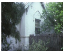
Former Head Teacher's Residence Heidelberg Side Windows September 1984