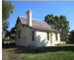
h01617 former head teacher's residence heidelberg side view 02 jan2001