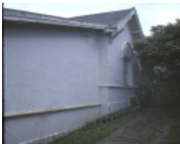
Former Head Teacher's Residence Heidelberg Side View September 1984