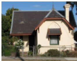
FORMER HEAD TEACHER'S RESIDENCE SOHE 2008