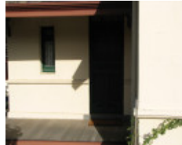
FORMER HEAD TEACHER'S RESIDENCE SOHE 2008