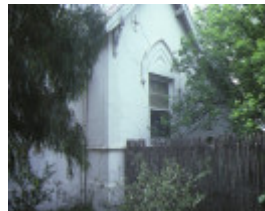
Former Head Teacher's Residence Heidelberg Side Windows September 1984