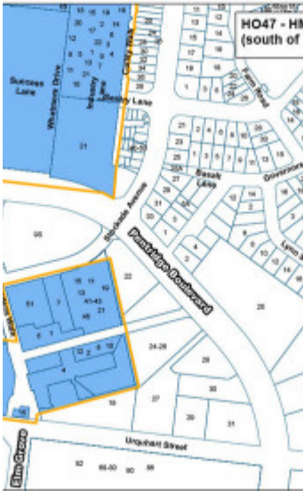
HM Prison Pentridge Precinct (south of Pentridge Boulevard)