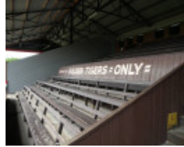
Bridges Reserve and City Oval