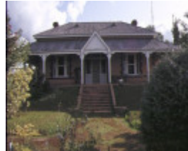
1 hopetoun house evenyl crescent hopetoun front view sep1992