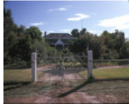
hopetoun house evelyn crescent hopetoun front gates apr1989