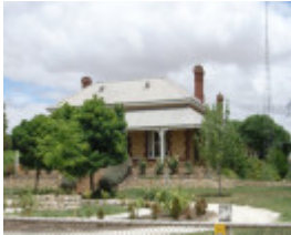
HOPETOUN HOUSE SOHE 2008