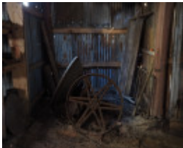
Battery House - Interior