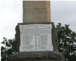
EUREKA HISTORIC PRECINCT SOHE 2008