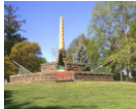
1 eureka monument view nov1999 db