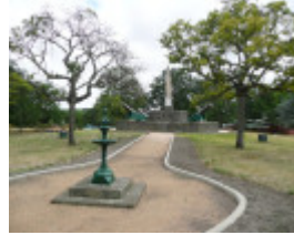
EUREKA HISTORIC PRECINCT SOHE 2008