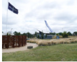
EUREKA HISTORIC PRECINCT SOHE 2008