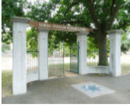
EUREKA HISTORIC PRECINCT SOHE 2008