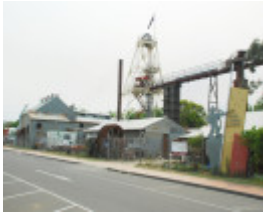
CENTRAL DEBORAH GOLD MINE SOHE 2008