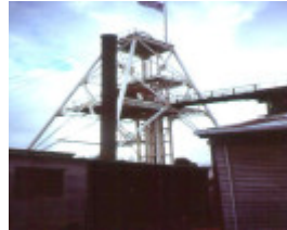
1 central deborah gold db june1999