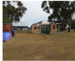
Context showing Harricks Cottage with the demounted prefabricated building under the tarpaulin May 2018