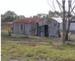
PREFABRICATED BUILDING SOHE 2008