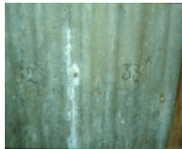
Prefabricated Cottage Iron Numbering September 2001