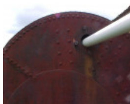
Prefabricated Cottage Boiler