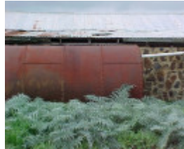
Prefabricated Cottage Boiler