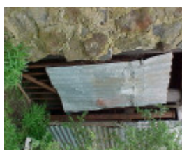
Prefabricated Cottage Stables Gate