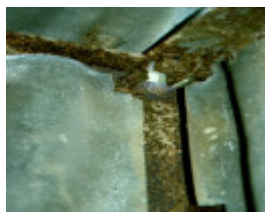
Prefabricated Cottage Interior Corner Detail September 2001