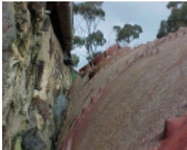
Prefabricated Cottage Boiler