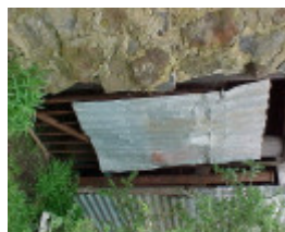
Prefabricated Cottage Stables Gate