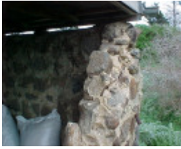
Prefabricated Iron Building Stables Rubble Wall