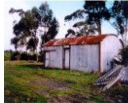
H01971 1 prefabricated iron cottage exterior