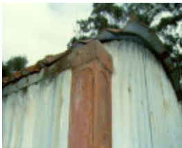
Prefabricated Cottage Corner Detail September 2001