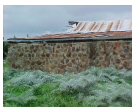
Prefabricated Cottage Stables