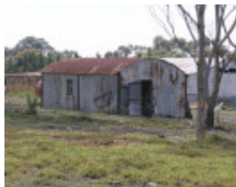
PREFABRICATED BUILDING SOHE 2008