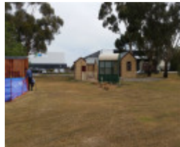
Context showing Harricks Cottage with the dismantled prefabricated building under the tarpaulin May 2018