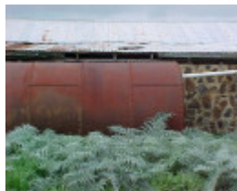
Prefabricated Cottage Boiler