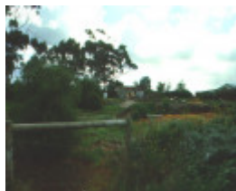
Prefabricated Cottage Context September 2001