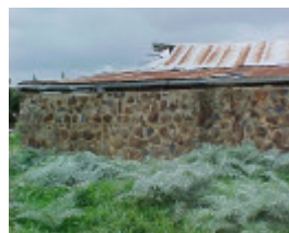
Prefabricated Cottage Stables