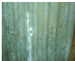
Prefabricated Cottage Iron Numbering September 2001