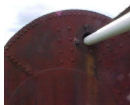
Prefabricated Cottage Boiler