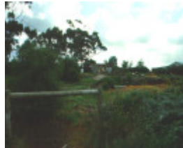
Prefabricated Cottage Context September 2001