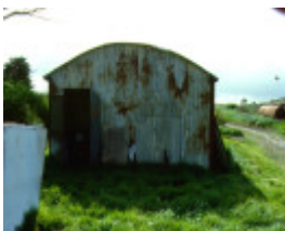
Prefabricated Cottage Side Elevation August 2001