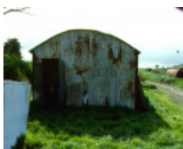
Prefabricated Cottage Side Elevation August 2001