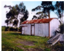
H01971 1 prefabricated iron cottage exterior