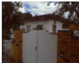
Concrete House Port Melbourne November 1999