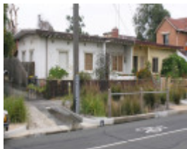
EXPERIMENTAL CONCRETE HOUSES SOHO 2008