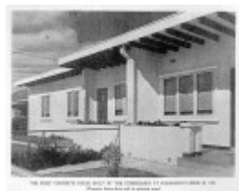
1 concrete houses vhc 1943 annual report