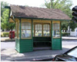
TRAM SHELTER SOHE 2008