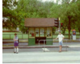
1 tram shelter cnr st kilda rd & high st melbourne