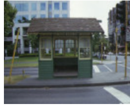
1 tram shelter cnr st kilda rd and lorne st melbourne east elevation dec1999