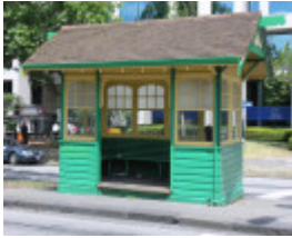
TRAM SHELTER SOHE 2008