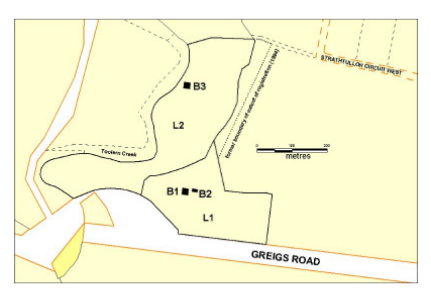
strathtulloh plan 2000