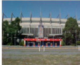
1 waverley park 1 mar00 pm1