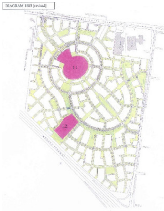
h01883 waverley park plan revised