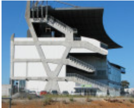
WAVERLEY PARK SOHE 2008