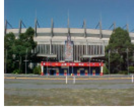
1 waverley park 1 mar00 pm1