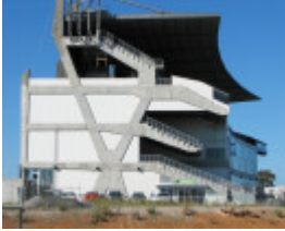
WAVERLEY PARK SOHE 2008