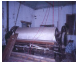
former female refuge complex scott pde ballarat mangle side view she project 2003