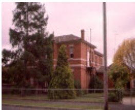
1 female refuge ballarat ac2 may00