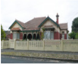
FORMER FEMALE REFUGE COMPLEX SOHE 2008