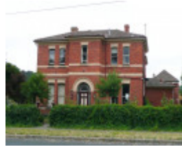
FORMER FEMALE REFUGE COMPLEX SOHE 2008