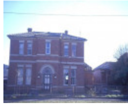
former female refuge complex scott pde ballarat east front view she project 2003