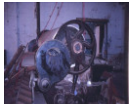
former female refuge complex scott pde ballarat mangle in laundry she project 2003