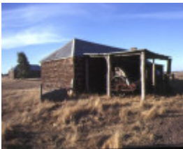
fulham balmoral horsham rd kanagulk woolshed complex feb1980