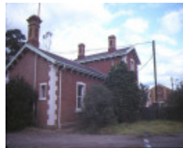
kangaroo flat railway station complex rear view jul1984