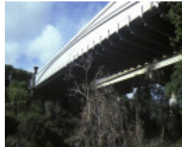
iron bridge maribyrnong river side elevation sep1984