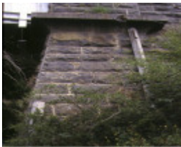
iron bridge maribyrnong river stone support detail