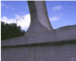
iron bridge maribyrnong river detail of iron siding