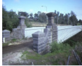
1 iron bridge maribyrnong river front view sep1984