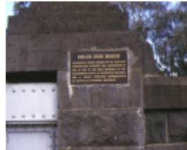
iron bridge maribyrnong river plaque detail