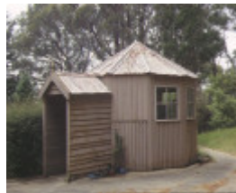
primary school number 1290 bolinda cherokee road kerrie shelter shed dec1998