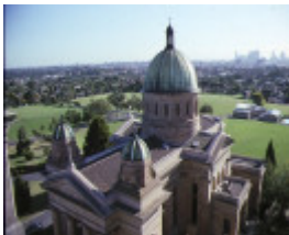
xavier college kew chapel aerial view