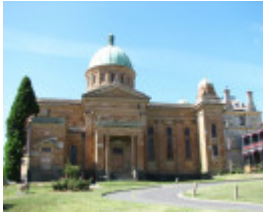
XAVIER COLLEGE SOHE 2008