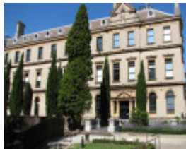
XAVIER COLLEGE SOHE 2008