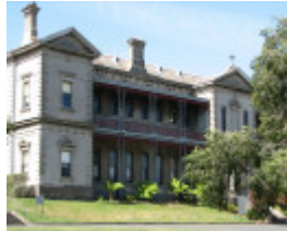
XAVIER COLLEGE SOHE 2008