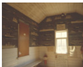
her2000 000160 1 fishermans shed interior view sw april00