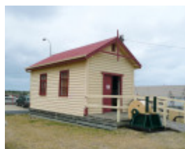
FISHERMAN'S SHED SOHE 2008