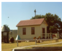
her2000 000160 fishermans shed exterior view sw april00