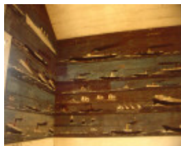
her2000 000160 fishermans shed interior detail sw april00