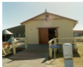
her2000 000160 fishermans shed front elevation sw april00