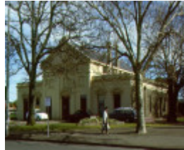
1 kyneton mechanics ac2 august00