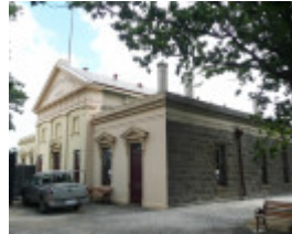
MECHANICS INSTITUTE AND LIBRARY SOHE 2008