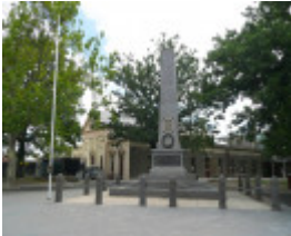
MECHANICS INSTITUTE AND LIBRARY SOHE 2008