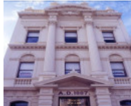
ballarat trades hall camp street ballarat close up she project 2003