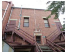
H0657 BALLARAT TRADES HALL LHA 2015 5.JPG