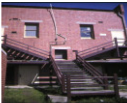
ballarat trades hall rear view