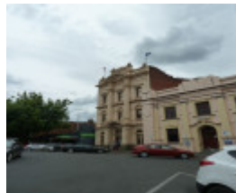
H0657 BALLARAT TRADES HALL LHA 2015 2.JPG