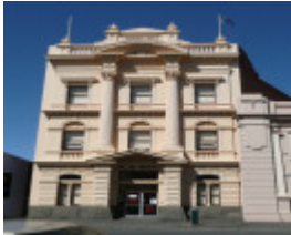
BALLARAT TRADES HALL SOHE 2008