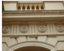
H0657 BALLARAT TRADES HALL LHA 2015 4.JPG