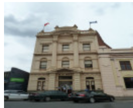
H0657 BALLARAT TRADES HALL LHA 2015 1.JPG