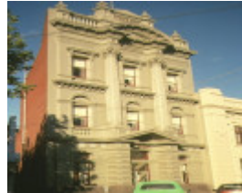
1 ballarat trades hall camp street ballarat front elevation