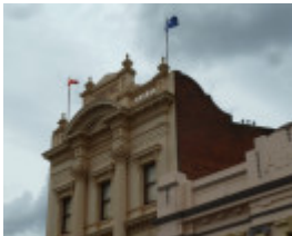
H0657 BALLARAT TRADES HALL LHA 2015 3.JPG