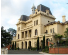
FORMER WILLSMERE HOSPITAL SOHE 2008