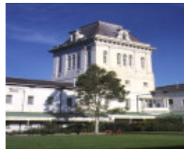
former willsmere hospital kew view of tower jun1988