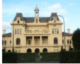
FORMER WILLSMERE HOSPITAL SOHE 2008