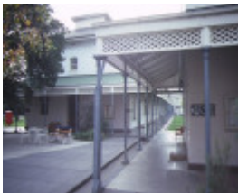
former willsmere hospital kew hospital wing jun1984