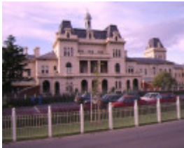
1 former willsmere hospital kew front view june 1995