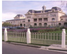
former willsmere hospital kew front elevation jun1995