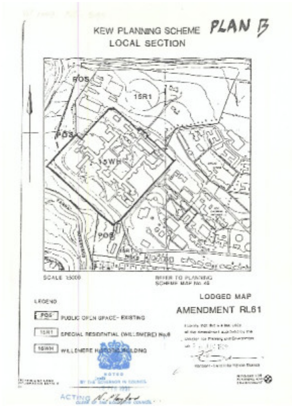
H0861 Plan B