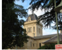
FORMER WILLSMERE HOSPITAL SOHE 2008