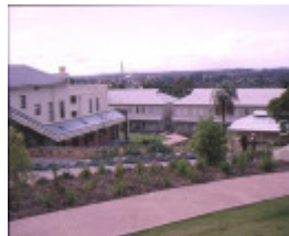
former willsmere hospital kew view of grounds june 1995