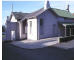
former willsmere hospital kew gatehouse june 1988