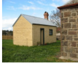
View of outbuilding. Aug 2007.