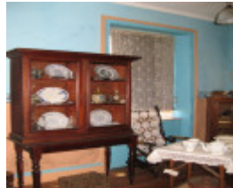
Interior - southwest room. Aug 2007.