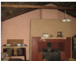
Interior - outbuilding east wing. Aug 2007.