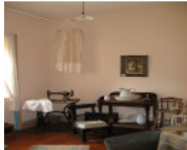
Interior - northeast room. Aug 2007.