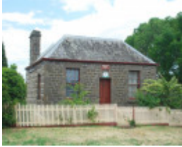
WHITBURGH COTTAGE SOHE 2008