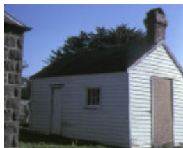
1 whitburgh cottage piper street kilmore outbuilding