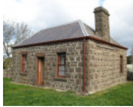
General external view. Aug 2007.