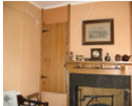
Interior - northwest room. Aug 2007.