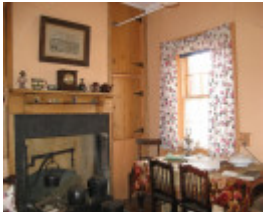
Interior - northwest room. Aug 2007.