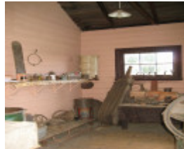
Interior - outbuilding west wing. Aug 2007.