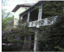
bindley house powlett street kilmore front view nov1983