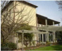
H0824 Bindley house kilmore sept05 side verandah