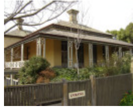
H0824 Bindley house kilmore sept05 front