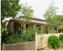
BINDLEY HOUSE SOHE 2008