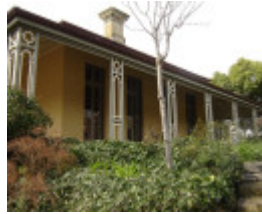
Bindley House Kilmore September 05