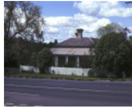
1 bindley house powlett street kilmore verandah detail nov1983