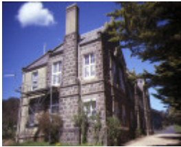
kilmore district hospital rutledge street kilmore side elevation oct1985