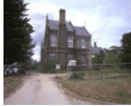
kilmore district hospital rutledge street kilmore entrance gate dec1984