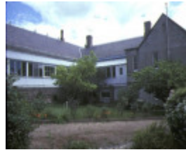
kilmore district hospital rutledge street kilmore hospital wing oct1985