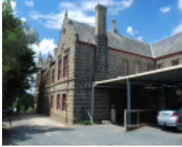
KILMORE DISTRICT HOSPITAL SOHE 2008