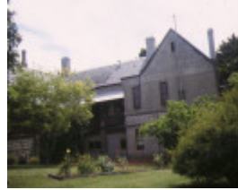
1 kilmore district hospital rutledge street kilmore rear view nov1997