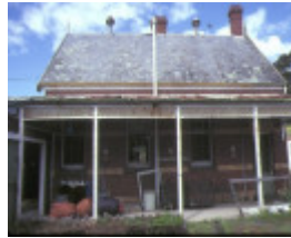
kilmore district hospital rutledge street kilmore infectious diseases oct1985