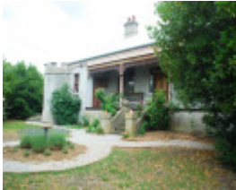
THE TOWERS SOHE 2008