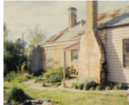
the towers victoria parade kilmore rear view cottage