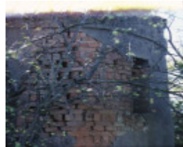
the towers victoria parade kilmore right hand tower may1983