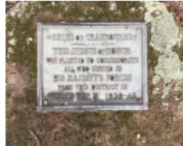
World War Two Memorial Plaque South Gippsland Highway