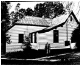
163 - Teachers Residence at State School 1134 04 - Shire of Eltham Heritage Study 1992