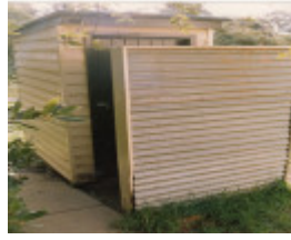
Teachers Residence at State School 1134 Colour 4 - Shire of Eltham Heritage Study 1992