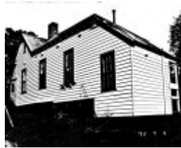
163 - Teachers Residence at State School 1134 03 - Shire of Eltham Heritage Study 1992