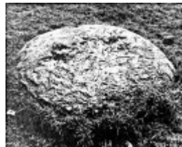
163 - Teachers Residence at State School 1134 05 - Shire of Eltham Heritage Study 1992