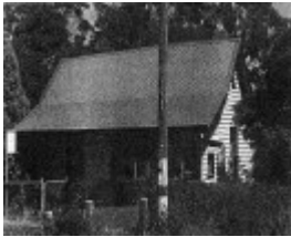
163 - Teachers Residence at State School 1134 - Shire of Eltham Heritage Study 1992