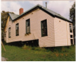
Teachers Residence at State School 1134 Colour 2 - Shire of Eltham Heritage Study 1992