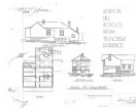
163 - Teachers Residence at State School 1134 08 - Shire of Eltham Heritage Study 1992