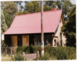
Teachers Residence at State School 1134 Colour 7 - Shire of Eltham Heritage Study 1992