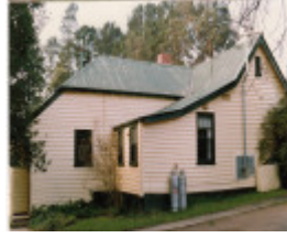
Teachers Residence at State School 1134 Colour 3 - Shire of Eltham Heritage Study 1992