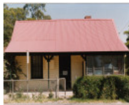
Teachers Residence at State School 1134 Colour 1 - Shire of Eltham Heritage Study 1992