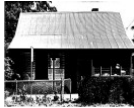
163 - Teachers Residence at State School 1134 02 - Shire of Eltham Heritage Study 1992