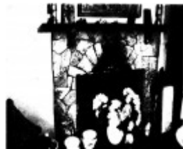
170 - Penleigh Boyd House North Warrandyte 20 - Shire of Eltham Heritage Study 1992