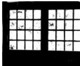
170 - Penleigh Boyd House North Warrandyte 21 - Shire of Eltham Heritage Study 1992