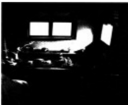
170 - Penleigh Boyd House North Warrandyte 19 - Shire of Eltham Heritage Study 1992