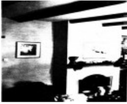
170 - Penleigh Boyd House North Warrandyte 13 - Shire of Eltham Heritage Study 1992