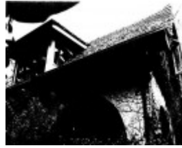
170 - Penleigh Boyd House North Warrandyte 14 - Shire of Eltham Heritage Study 1992