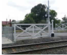
KYNETON RAILWAY STATION COMPLEX SOHE 2008