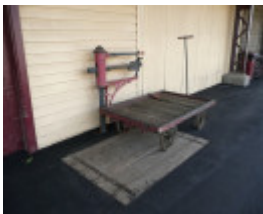
KYNETON RAILWAY STATION COMPLEX SOHE 2008