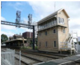
KYNETON RAILWAY STATION COMPLEX SOHE 2008