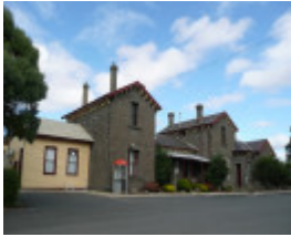
KYNETON RAILWAY STATION COMPLEX SOHE 2008