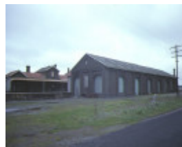
railway station goods shed & water tower station street kyneton goods shed sep1984