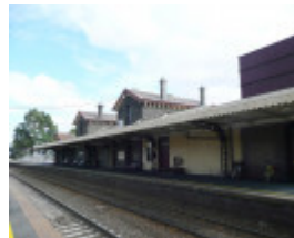
KYNETON RAILWAY STATION COMPLEX SOHE 2008