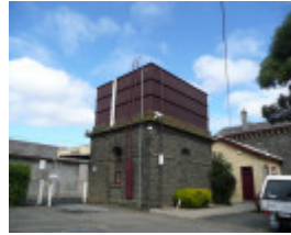
KYNETON RAILWAY STATION COMPLEX SOHE 2008