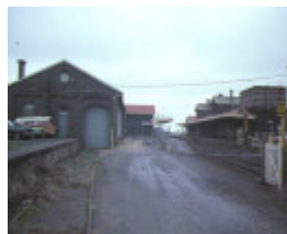
railway station goods shed & water tower station street kyneton property view sep1984