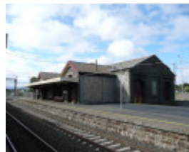
KYNETON RAILWAY STATION COMPLEX SOHE 2008