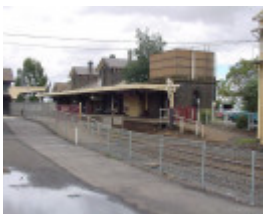
Kyneton Station North View