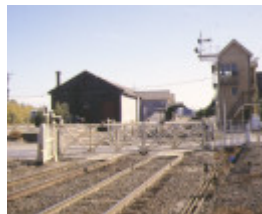
Railway Station Goods Shed & Water Tower Station Street Kyneton Signal Box & gates April 1994