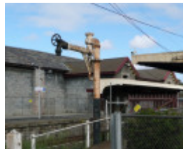
KYNETON RAILWAY STATION COMPLEX SOHE 2008