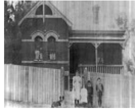
194 - State School 209 Residence Pines 690 Main Rd 02 - Old photograph (ELHPC NO.716) - Shire of Eltham Heritage Study 1992