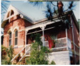
State School 209 Residence Pines 690 Main Rd Colour 3 - Shire of Eltham Heritage Study 1992