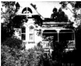
194 - State School 209 Residence Pines 690 Main Rd 04 - Shire of Eltham Heritage Study 1992