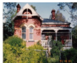
State School 209 Residence Pines 690 Main Rd Colour 2 - Shire of Eltham Heritage Study 1992