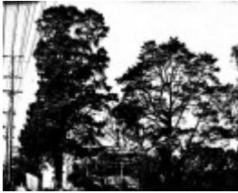
194 - State School 209 Residence Pines 690 Main Rd - Shire of Eltham Heritage Study 1992