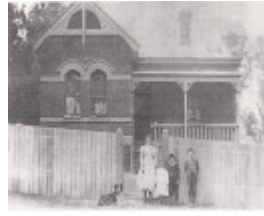
State School 209 Residence Pines 690 Main Rd Black & White 1 - Shire of Eltham Heritage Study 1992