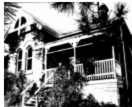
194 - State School 209 Residence Pines 690 Main Rd 05 - Shire of Eltham Heritage Study 1992