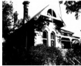
194 - State School 209 Residence Pines 690 Main Rd 03 - Shire of Eltham Heritage Study 1992