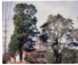
State School 209 Residence Pines 690 Main Rd Colour 4 - Shire of Eltham Heritage Study 1992