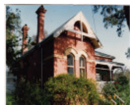
State School 209 Residence Pines 690 Main Rd Colour 1 - Shire of Eltham Heritage Study 1992