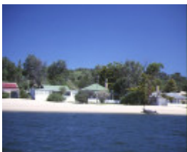
new works lakes entrance view of houses