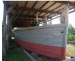
NEW WORKS HISTORIC COMPLEX SOHE 2008