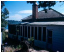
New Works Historic Complex Lakes Entrance Breezy 2006