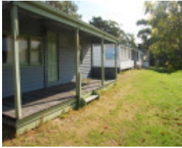
NEW WORKS HISTORIC COMPLEX SOHE 2008