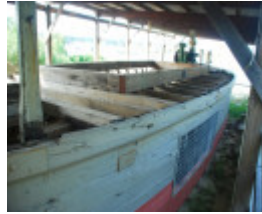
NEW WORKS HISTORIC COMPLEX SOHE 2008