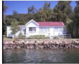
H1532 new works lakes entrance house lot 18