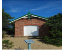
NEW WORKS HISTORIC COMPLEX SOHE 2008