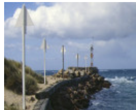
new works lakes entrance view of barrier