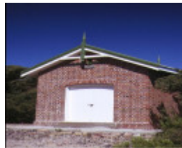
new works lakes entrance rocket shed