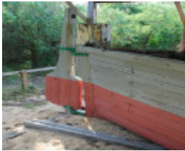
NEW WORKS HISTORIC COMPLEX SOHE 2008