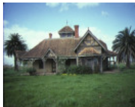
karlsruhe lancaster front view