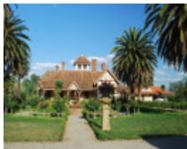
KARLSRUHE SOHE 2008