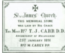
B4844 St James' RC Church Plaque