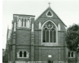
B4844 St James' RC Church West Front