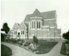
B4844 St James' RC Church