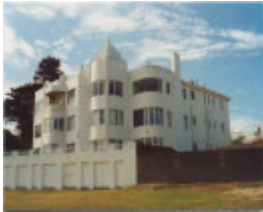
B7146 Ostend Flats