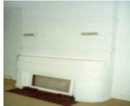
B7146 Ostend Flats Fireplace