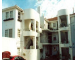
B7146 Ostend Flats Entrance