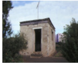
elcho homestead elcho road lara outbuilding