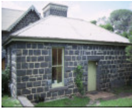
elcho homestead elcho road lara rear view bluestone