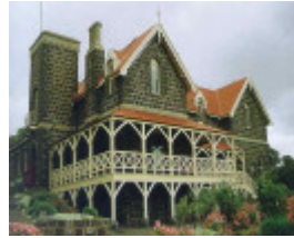
elcho homestead elcho road lara corner view publication