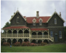
1 elcho homestead lara front view