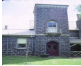
elcho homestead elcho road lara tower view