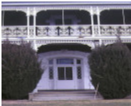
pirra homestead windermere road lara entrance sep1982