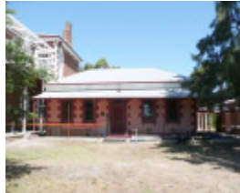
PIRRA HOMESTEAD SOHE 2008