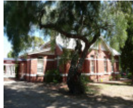
PIRRA HOMESTEAD SOHE 2008