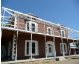
PIRRA HOMESTEAD SOHE 2008