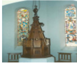
B5960 St Mark's Camberwell