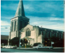
B5960 St Mark's Camberwell