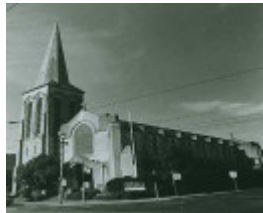
B5960 St Mark's Anglican Church