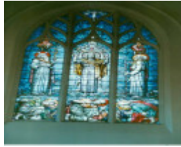
B5960 St Mark's Camberwell